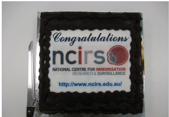
Staff at NCIRS celebrated with a branded cake to mark the launch of the new website