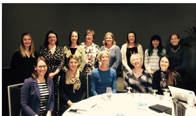
PAEDS Investigation Nurses at the 10th Anniversary Showcase

In June 2017 Paediatric Active Enhanced Disease Surveillance (PAEDS) investigators, nurses and key stakeholders came together in Melbourne to discuss and present their work of 10 years in an anniversary showcase. PAEDS, originally founded through a collaboration between the Australian Paediatric Surveillance Unit (APSU) and NCIRS has grown to surveillance at 7 sites across Australia, focusing on vaccine preventable diseases and serious childhood conditions of public health importance: Acute Flaccid Paralysis, intussusception, pertussis, varicella, febrile seizures,