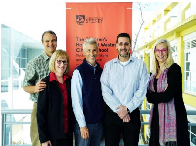
The HDR Team

Congratulations to the Discipline of Child & Adolescent Health's Higher Degree by Research (HDR) Team which has won the 2017 Vice-Chancellor's Award for Excellence in the category of Outstanding Research Higher Degree Supervision.