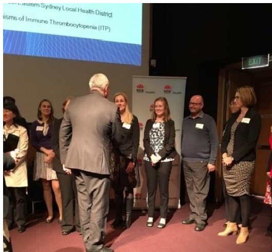
Scholarship award ceremony at The University of Sydney